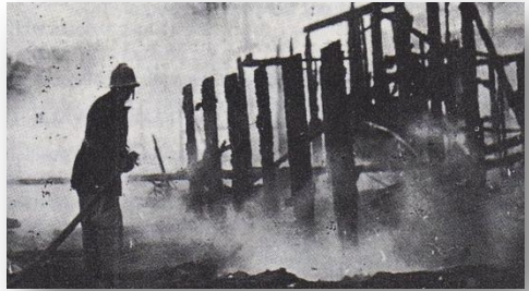
Promotion was achieved despite the main stand being burnt down

The promotion drive gathered momentum with a dramatic 4-3 win over Chester - Ron Smith scoring the last minute winner direct from a corner-kick -